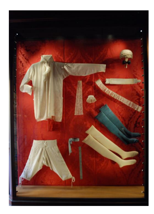
Suit, undergarments and accessories - Kensington Palace

Printed cotton velvet (velveret) suit with cotton-linen and linen linings