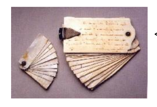
< Jefferson's Our Aide Memoire >