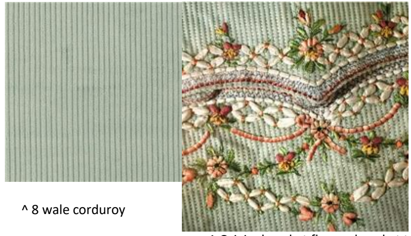
^ Original pocket flap and pocket tr