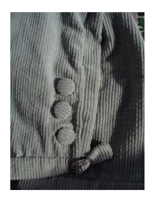
< Replica breeches leg Original breeches leg >

The breeches use Eagle's View Broadfall Drop Front Breeches Pattern. The buttons are formed over bone button molds for both breeches front and knees. The button and buckle holes are hand worked.