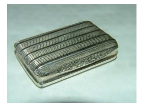
Snuff Box < Our snuffbox Georgian Snuffbox >